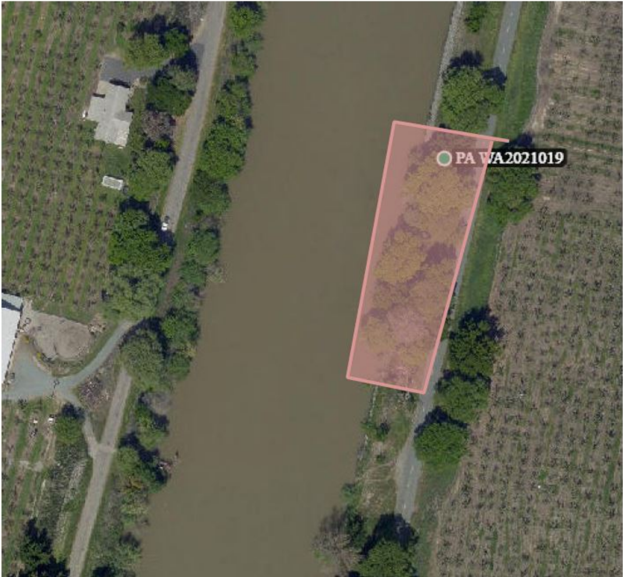
3) Proposed project footprint map